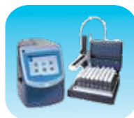
Total Organic Carbon 3800